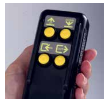
Exterior control pendant. (VSL-6000 only)