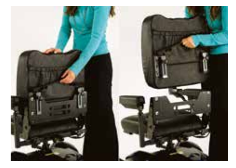
Back-Off easily removes back of mobility device to fit into shorter vehicle openings.