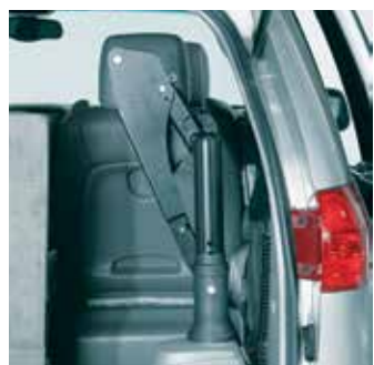
Quick release pin allows lift head to fold down.