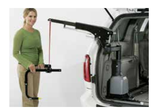
Driver side placement.