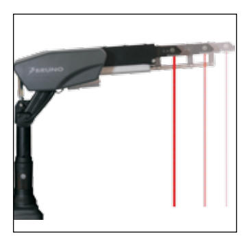
Telescoping version. (VSL 6900)