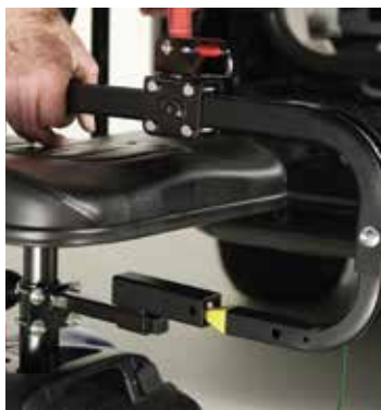
Custom docking devices.